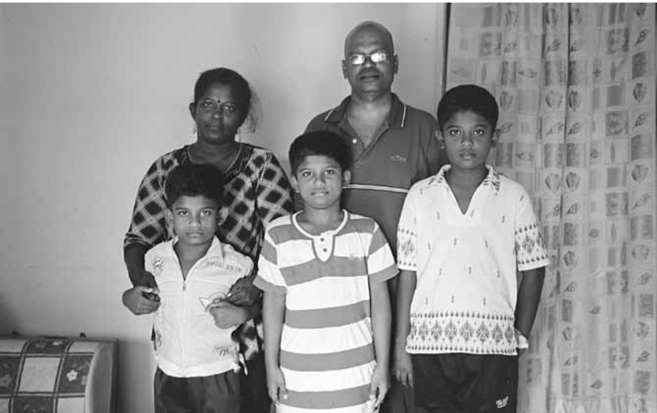
A Sri Lankan family was forced to leave their country after which they were detained and children and the father were separated from their mother.