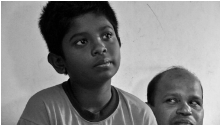
A Sri Lankan family was forced to leave their country after which they were detained and the children and there father were seperared from the mother in detention.