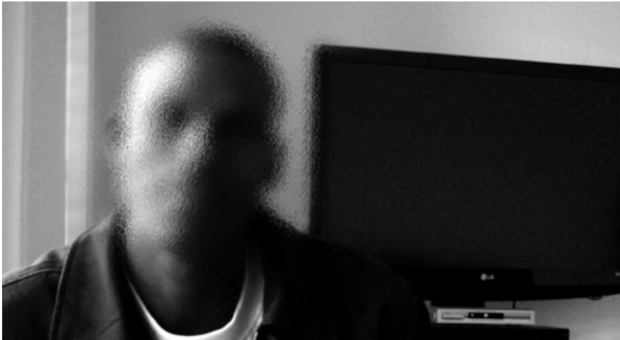
Sudanese boy who was detained in Malta at the age of 16

Refugee, asylum seeker and irregular migrant children need the means of material survival. They need the capacity to meet their daily nutritional requirements and to be adequately clothed. This is consistent with Article 27 of the Convention on the Rights of the Child noted above, which stipulates that children have a right 'to a standard of living adequate for the child's physical, mental, spiritual, moral and social development.' 154 The capacity of states to deliver adequate means of material support will differ. Where capacity is limited, the Committee on the Rights of the Child has specified that states should 'accept and facilitate the assistance offered by UNICEF, UNESCO, UNHCR and other United Nations agencies within their respective mandates, as well as, where appropriate, other competent intergovernmental organizations or non-governmental organizations (art. 22 (2)) in order to secure an adequate standard of living for unaccompanied and separated children.' 155